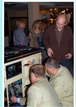
Taking a closer look