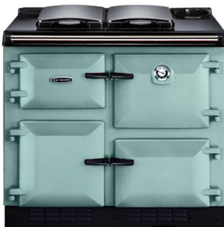
NEW Aqua colour