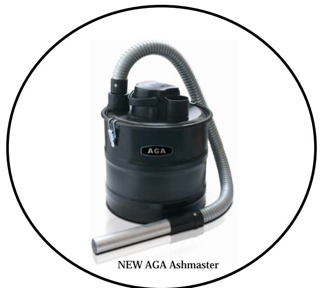
NEW AGA Ashmaster